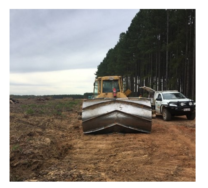
Figure 1. Chopper roller for site preparation - breaks down larger debris prior to planting, maximising debris retention.

Mounding refers to a specific silvicultural practice that involves creating raised soil mounds on the forest floor. The visits facilitated an improved understandiung of the difference between various mounding methods such as high, continuous, low and continuous mounding. Figure 2a shows example of continuous mounding.