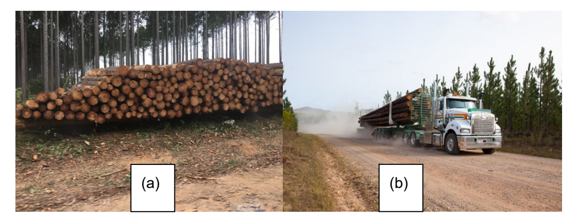
Figure 3. harvesting and haulage

The site visits assisted in improving the understanding of the various sites having different characteristics, including thinned and unthinned sites, as well as different soil types, aiming to understand their potential impact on growth. Additionally, I observed harvesting (Figure 3a), haulage (Figure 3b), and chipping operations to gain valuable insights into these forestry practices.